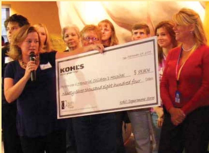
Members of Kohl's Department Store's A-Team present a check to Memorial Children's Hospital's NICU at the annual NICU reunion. Kohl's has been a regular supporter of Memorial Children's Hospital.

The day was filled with activities, refreshments and happy memories. Plus, in a feature ceremony, the Kohl's A-team representatives presented a $94,000 check to the NICU, partially from funds raised by Kohl's sale of $5 gifts at its regional retail centers in Mishawaka, South Bend, Goshen and Warsaw.